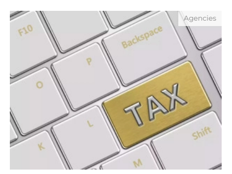
Tax experts say this would bring some relief to companies grappling with compliances in wake of Covid restrictions

"On consideration of difficulties reported by the taxpayers and other stakeholders due to COVID and in electronic filing of various reports of audit under the provisions of the Income-tax Act, 1961 (the Act), the Central Board of Direct Taxes (CBDT) has decided to further extend the due dates for filing of Income Tax Returns and various reports of audit for the Assessment Year 2021-22," an official statement said Tuesday.